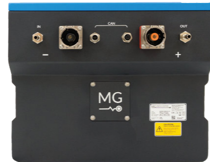
RS battery modules 44 V up to 88 V

High safety and flexible system configurations were the design principles during the development of the RS series Lithium-Ion battery. A modular and compact design makes system integration more flexible, especially in refit projects. Adding a redundant BMS and a unique cell-to-cell propagation protection takes safety to the next level. The liquid thermal management keeps the battery cells on temperature to extend cycle life and to improve the peak power performance. These features makes this battery suitable for large energy storage applications as well as small peak power packs in hybrid solutions.